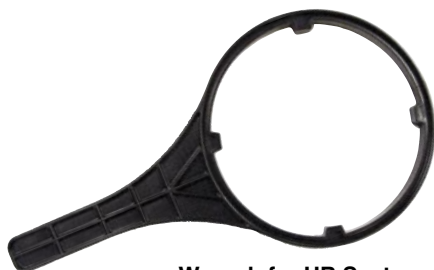
Wrench for HB System Product No. : 34135.0000

Warranty: BUNN warrants the Easy Clear ® hardware (excluding cartridges) to be free from defects in materials and workmanship for 1 year from the date of installation. See service manual for complete warranty statement.