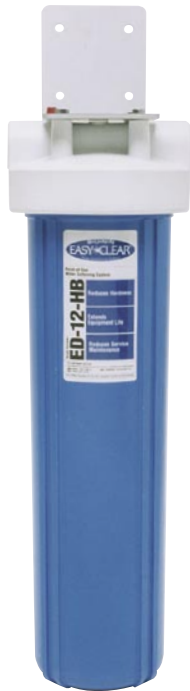
Model ED-12-HB Water Quality System