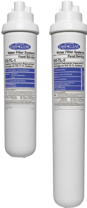
Model EQ-11-TL & EQ-12-TL Water Quality Systems