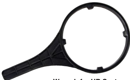
Wrench for HB System Product No. : 34135.0000

Warranty: BUNN warrants the Easy Clear® hardware (excluding cartridges) to be free from defects in materials and workmanship for 1 year from the date of installation. See service manual for complete warranty statement.