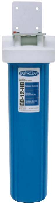
Model ED-12-HB Water Quality System